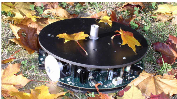
Fig. 1. Robotnacka, the drawing robot.

The mobile autonomous robot Robotnacka is shown in figure 1. It is a very accurate mobile two-wheel differential driven robot controlled by a simple 8-bit microcontroller. It can be remotely controlled over BlueTooth radio connection from a workstation. The robot is equipped with interchangeable pen, thus enabling drawing pictures on the paper or whiteboard. Operation time using the internal battery is at least one hour without recharging.